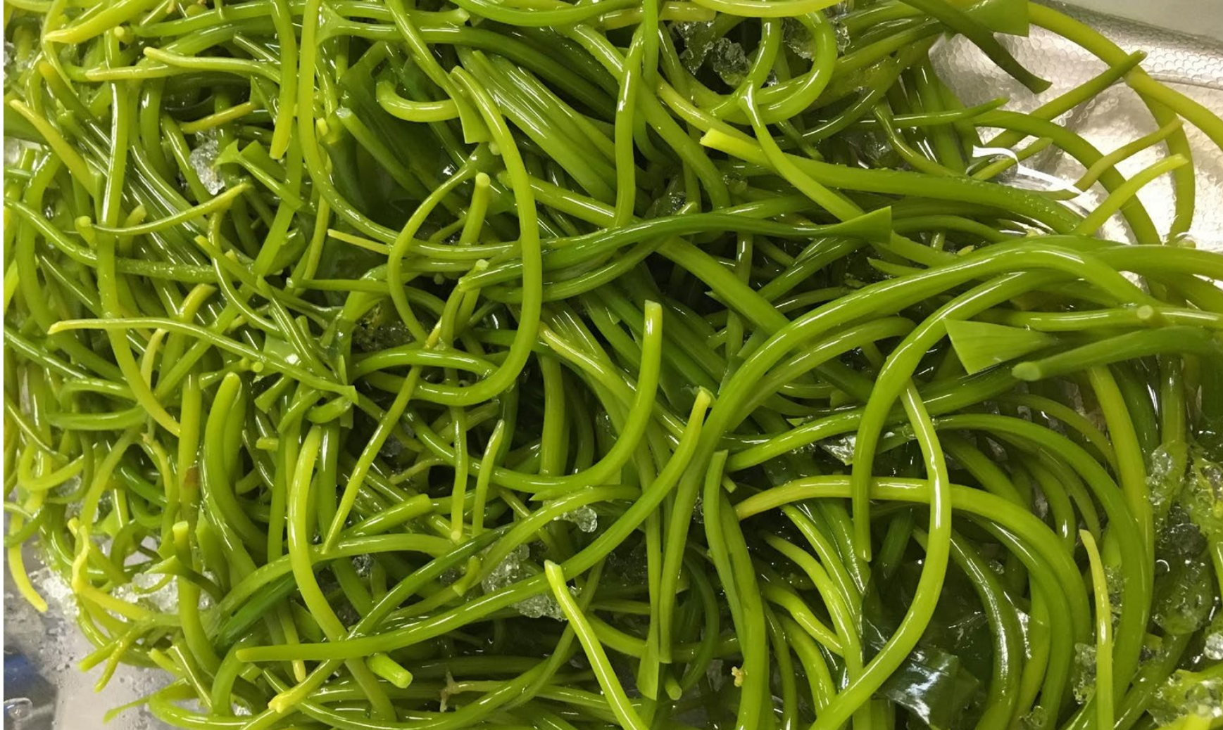
Blanched Kelp Stipes