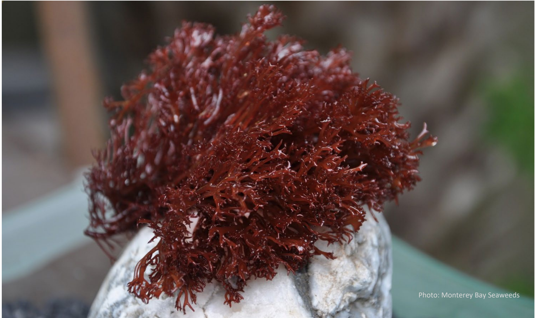
Red Ogo Produced in Tank