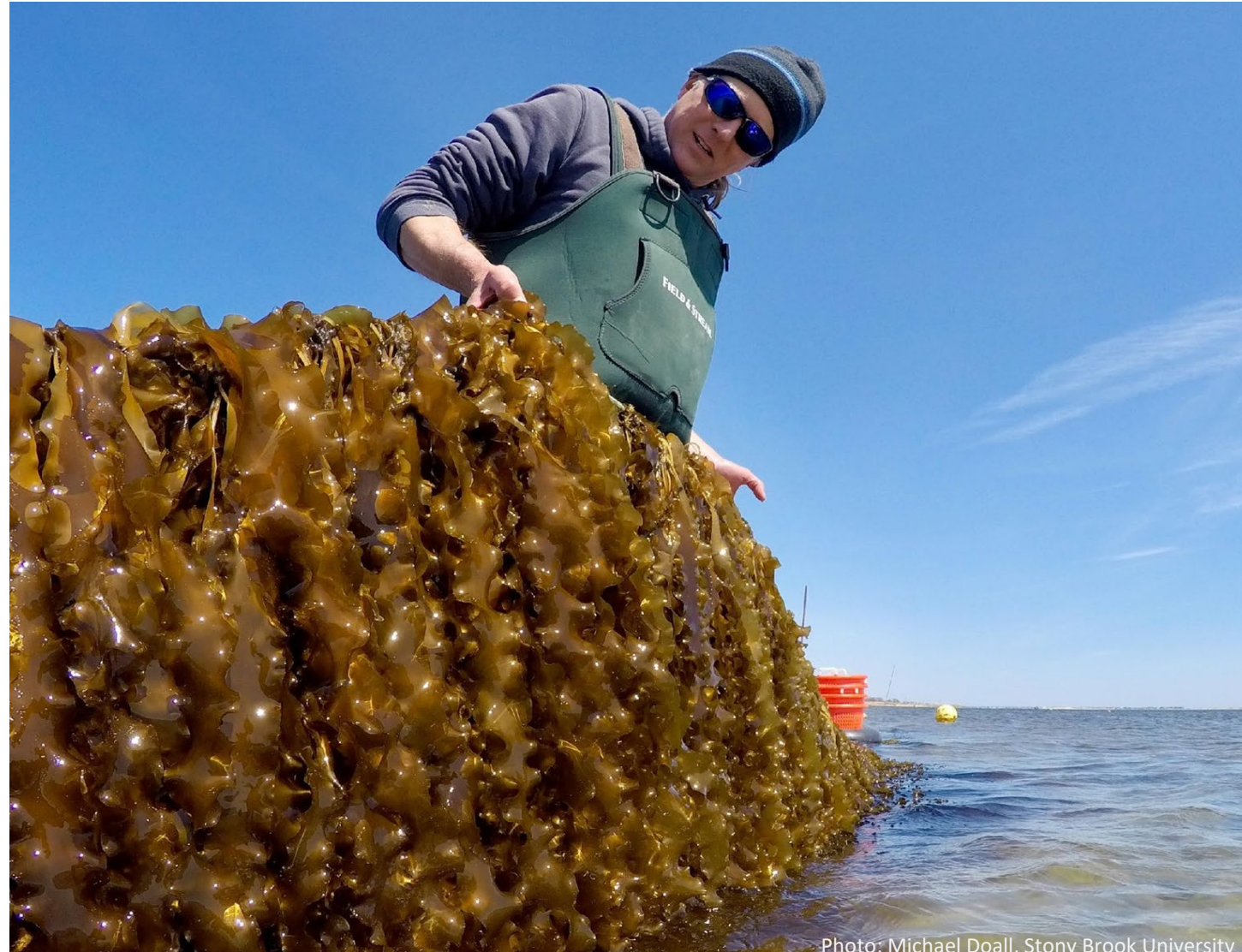
Research Farm Site