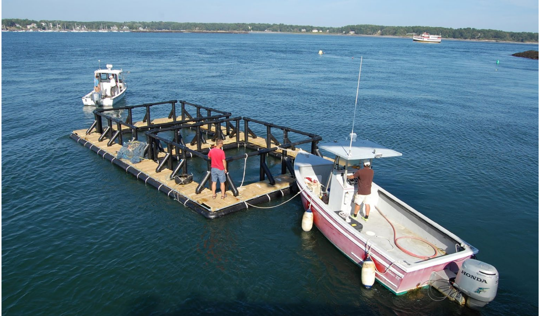
IMTA Site- Integrated Multi-Trophic Aquaculture